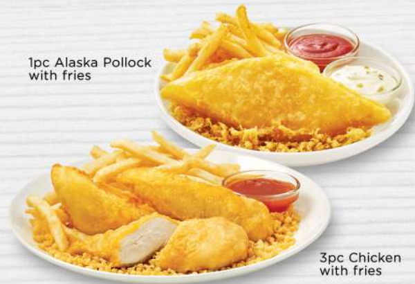
1pc Alaska Pollock with fries