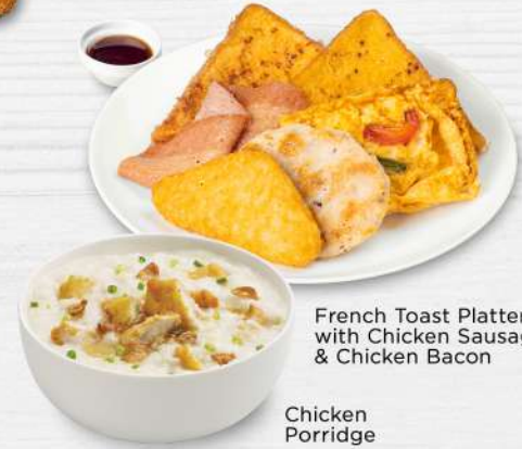
French Toast Platter with Chicken Sausage & Chicken Bacon