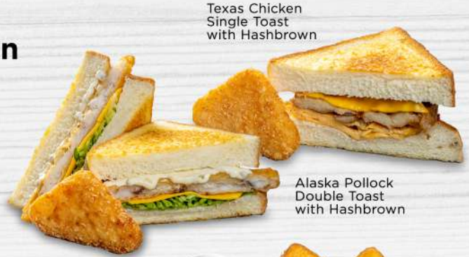
Texas Chicken Single Toast with Hashbrown