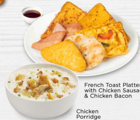
French Toast Platter with Chicken Sausage & Chicken Bacon