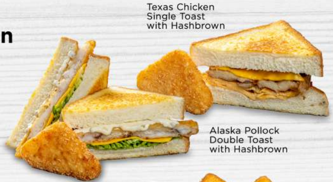
Texas Chicken Single Toast with Hashbrown